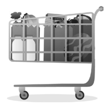
Information adapted from Michigan State University Extension article 'Overcoming barriers to living in a food desert'